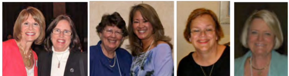
Officers for the new year were installed at Annual Session: